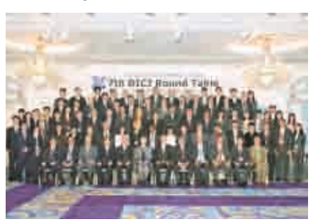
7th DICJ Round Table, Tokyo, Japan, 6–7 March 2013

The event was attended by representatives from: Argentina, Brazil, Colombia, Ecuador, El Salvador, Guatemala, Mexico, Nicaragua, Paraguay, Peru and Uruguay – as well as Honduras, which accepted the invitation to attend as a guest.